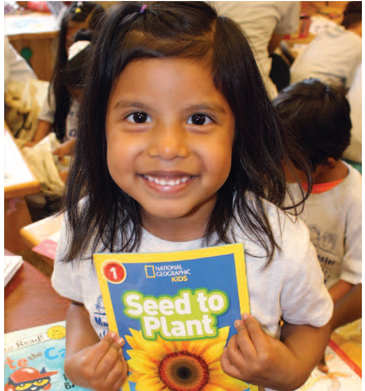
CHILDREN RECEIVE FREE BOOKS TO INSPIRE THE LOVE OF READING AS PART OF UNITED WAY'S SUMMER LITERACY PROGRAM.

This year, we introduced a new eight-week summer literacy program called "Summer Reading, Summer Feeding" at the BEAT Center in Toms River. Through a 2 Million & Change Grant from the Staples Foundation, 17 children practiced reading; participated in activities focusing on nutrition, bullying, manners and