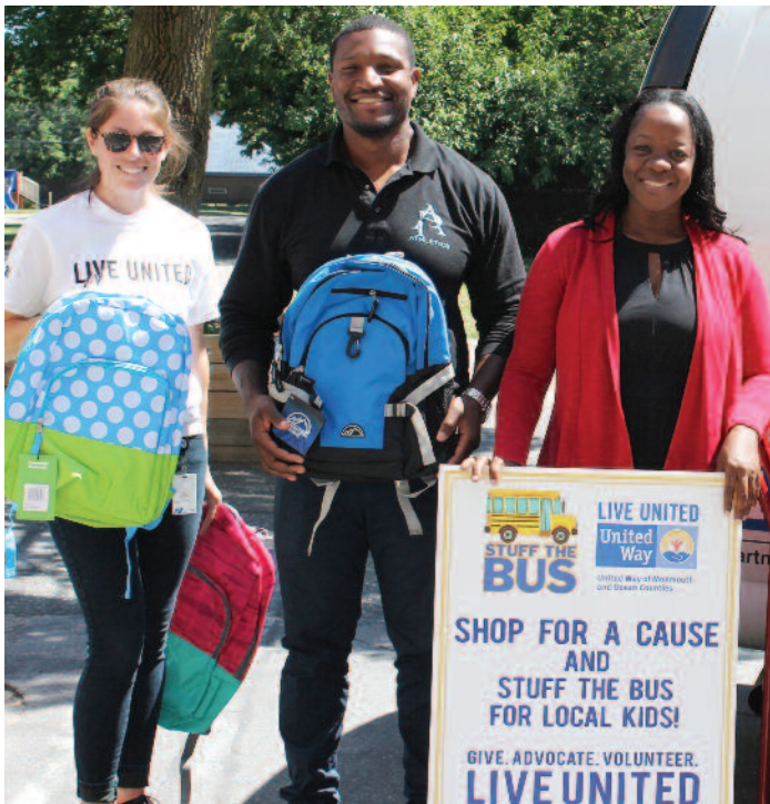
UNITED WAY STAFF MEMBERS DELIVER DONATED SCHOOL SUPPLIES TO BARACK OBAMA ELEMENTARY SCHOOL IN ASBURY PARK.

in Monmouth and Ocean Counties, and 55 local companies participated by collecting school supplies. More than 100 people volunteered at our store events and warehouse to count and sort donations. Thanks to the generosity of our community, we collected over 23,000 items for students in our partner schools and nonprofits. Thank you to all who participated!