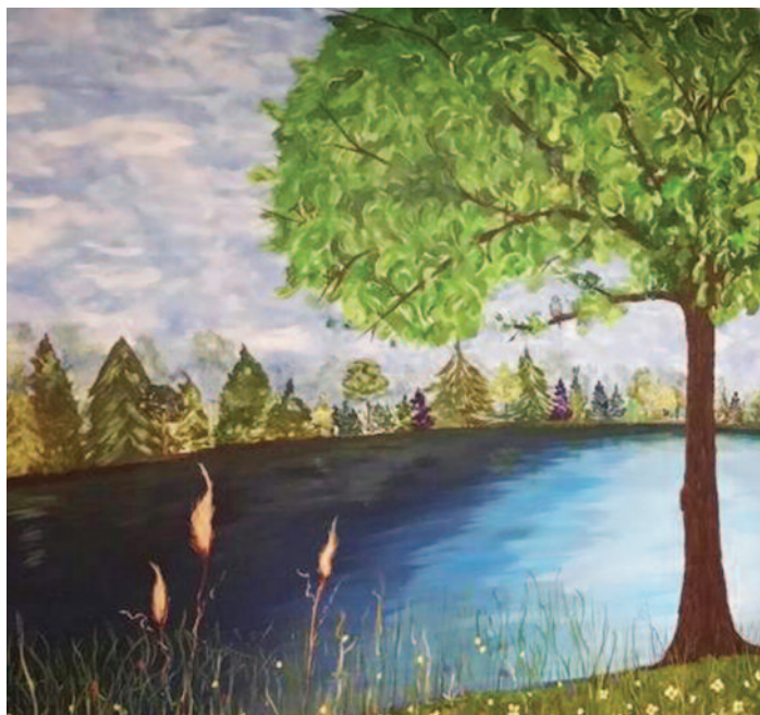
THE ABOVE IS A PORTION OF THE MURAL CREATED BY LOCAL ARTIST ELIZABETH PASELER AS PART OF UNITED WAY'S DAY OF ACTION.

Every year on United Way Day of Action, we harness the power of the volunteer spirit to improve lives and conditions in our community. On June 21, we mobilized 266 volunteers to participate in 13 projects at nine local nonprofits, including a blood drive and a golf outing. Efforts also included a mural painting created by an area artist on the walls of the addiction counseling area of the Preferred Behavioral Health building in Lakewood.