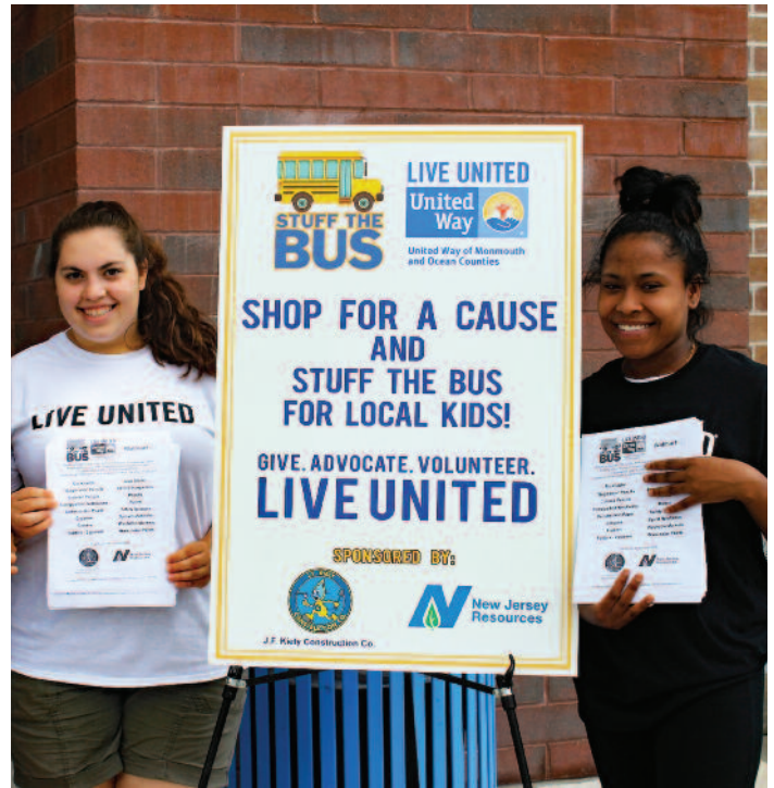
VOLUNTEERS DISTRIBUTE FLYERS TO SHOPPERS TO HELP COLLECT DONATIONS AT WALMART IN FREEHOLD.