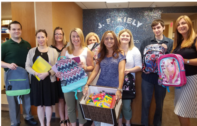
Stuff the Bus sponsor J.F. Kiely Construction Co. collected over 300 items for the school supplies drive to benefit local students.

Each summer, our Stuff the Bus drive collects essential school supplies for students throughout our community, ensuring that they begin the school year with the tools they need to succeed. Sponsored by J.F. Kiely Construction Co. and New Jersey Natural Gas, the 2017 drive had an incredible outpouring of support. Five events were held at Walmart and Wegmans stores in Monmouth and Ocean