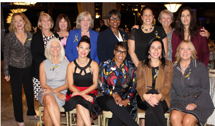
Women United members whose hard work and dedication made Casino Night possible.