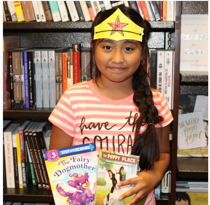
A student from the YMCA of Western Monmouth County receives free books as part of United Way's summer literacy program.

United Way of Monmouth and Ocean Counties worked with the following partners in order to make the summer