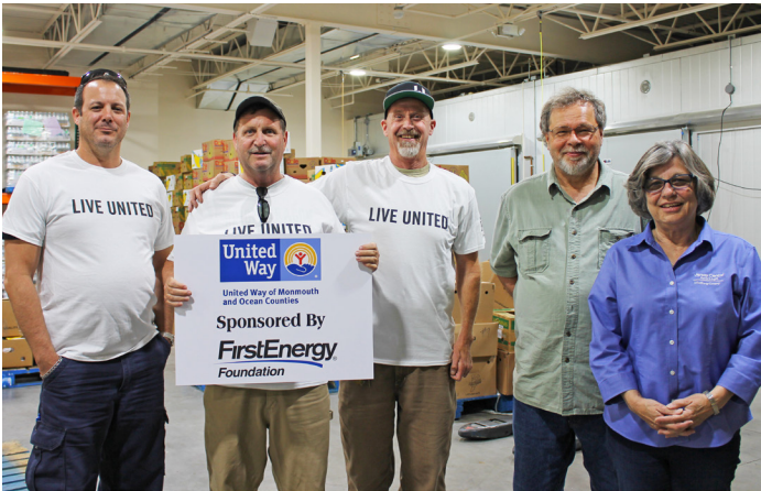
JCP&L employees sorted food and stocked the shelves at Fulfill on behalf of UWMOC's Day of Action.

United Ways around the nation hold an annual Day of Action on June 21 where we ask our friends, family and valued business partners to join us in improving lives and conditions in our community. This past June, UWMOC was joined by dozens of employees from L'Oréal, Exelon Generating, JCP&L and Cowan, Guteski & Co., P.A. Our volunteers worked tirelessly to assist with painting a warehouse for Holiday Express, repairing picnic tables and power washing playground equipment for Head Start, harvesting sweet potatoes at Collier Youth Services, stocking the shelves at Fulfill and Lunch Break, and clearing trails at a Boy Scouts camp. We also held a Red Cross blood drive at the Ocean County YMCA while volunteers worked to beautify the building's entryway. This Day of Action, 85 volunteers spent 340 hours making a difference in our community.